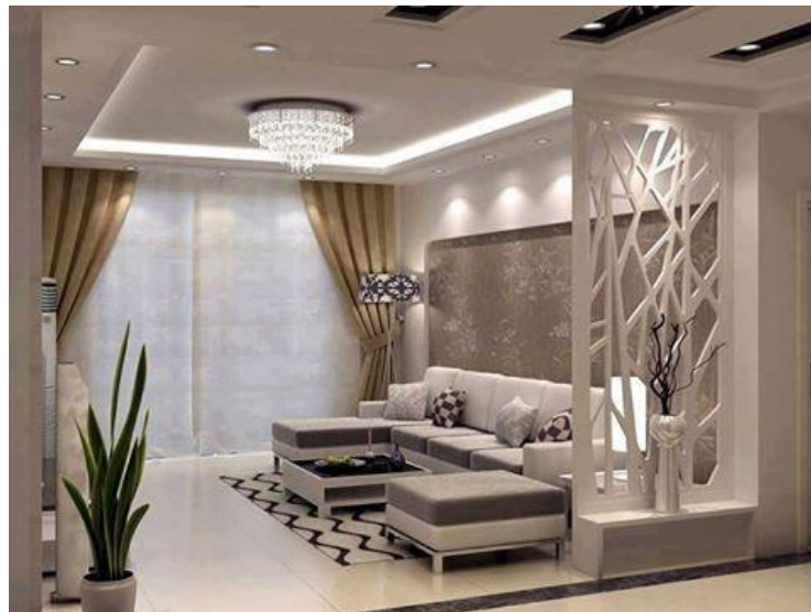
Fig. 5. Room divider, used as decorative element, part of the interior design

Screens can also be used to create a sense of privacy without completely blocking off the space. They allow light to pass through and maintain the visual volume of the room. In addition to their functional advantages, decorative screens also have aesthetic benefits. They can be used to add a decorative element to the space and can be designed in various styles to match existing décor (see Fig.5).