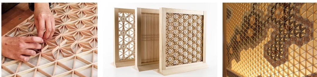
Fig. 1. The "Kumiko" technique, still used today to make decorative partitions

Today, decorative screens have established themselves as a popular choice for spatial divisions in hotels, restaurants, offices, and more. They are offered in various materials and sizes to fit any space.