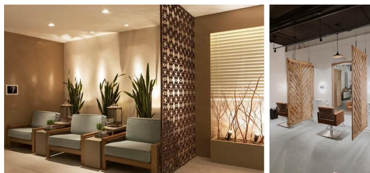
Fig. 3. Using decorative walls in Spa centers and beauty salons

Decorative screens are particularly suitable for use in Spa centers, beauty salons, and cosmetic studios (see Fig.3), where different areas for relaxation or procedures can be isolated, allowing each visitor to relax and enjoy their time alone.